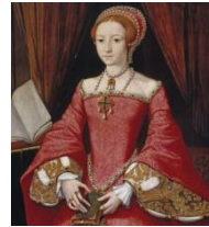
66. Queen Elizabeth I English Queen