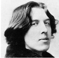
63. Oscar Wilde Irish writer