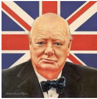
62. Sir Winston Churchill British Prime Minister