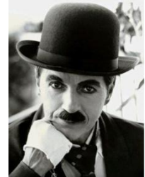
69. Charlie Chaplin English comedian