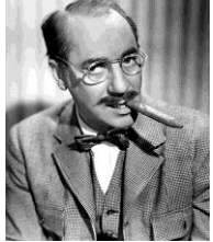
65. Groucho Marx American comedian