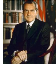
67. Richard Nixon American President