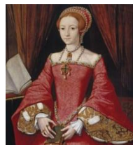
66. Queen Elizabeth I English Queen