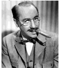
65. Groucho Marx American comedian