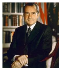
67. Richard Nixon American President