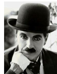
69. Charlie Chaplin English comedian