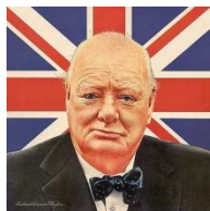
62. Sir Winston Churchill British Prime Minister