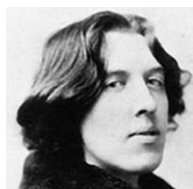
63. Oscar Wilde Irish writer